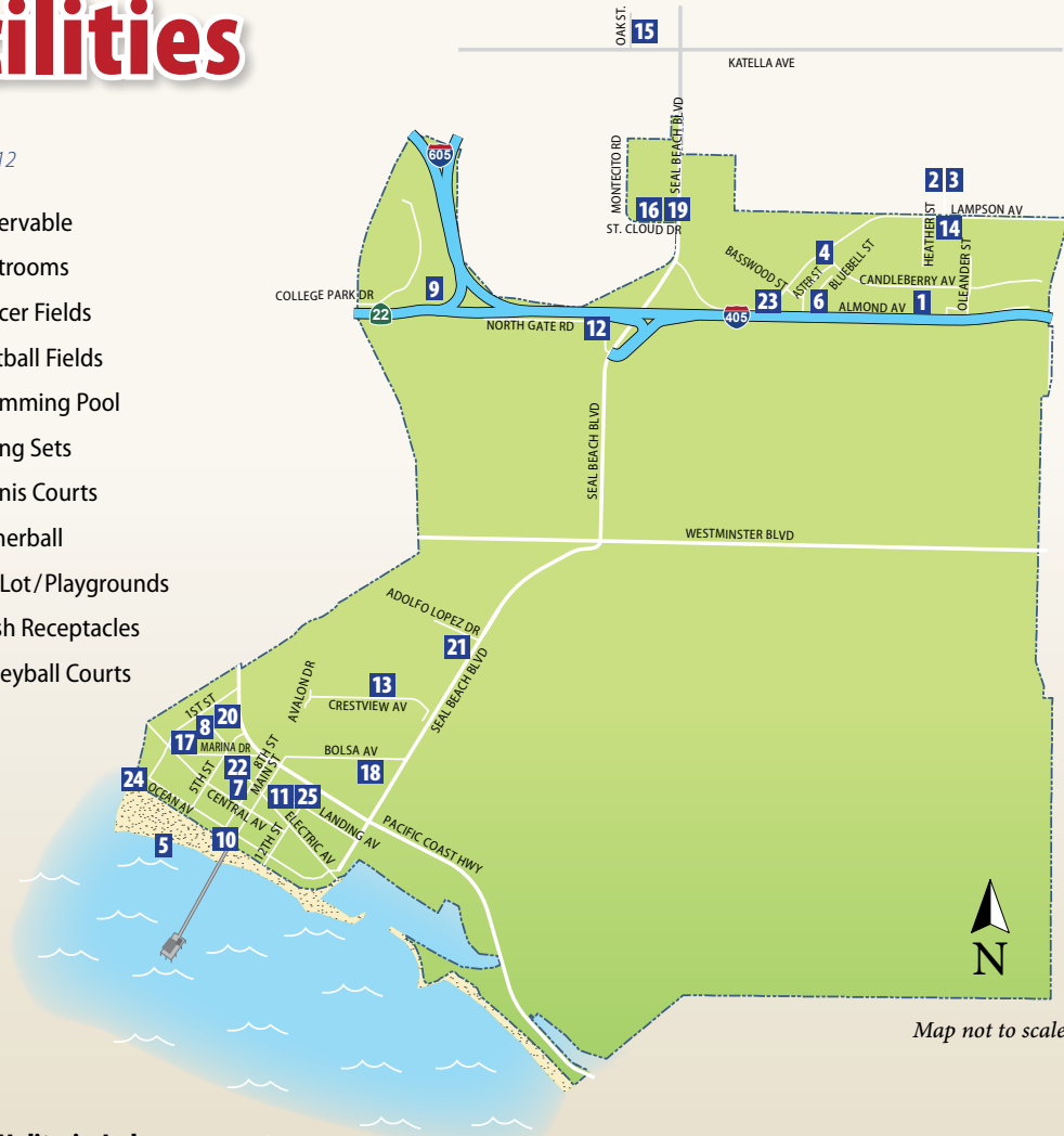
Map not to scale.