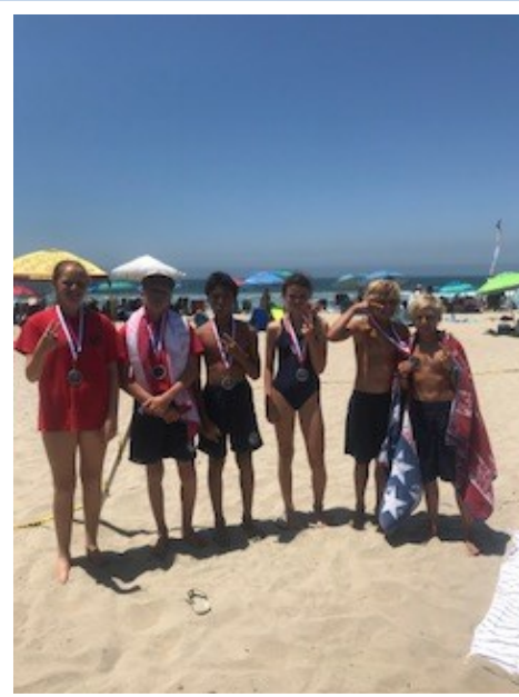
Run Relay Team — 2nd Place