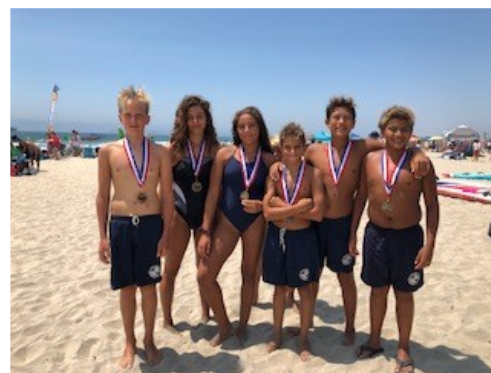
Swim Relay Team — 5th Place