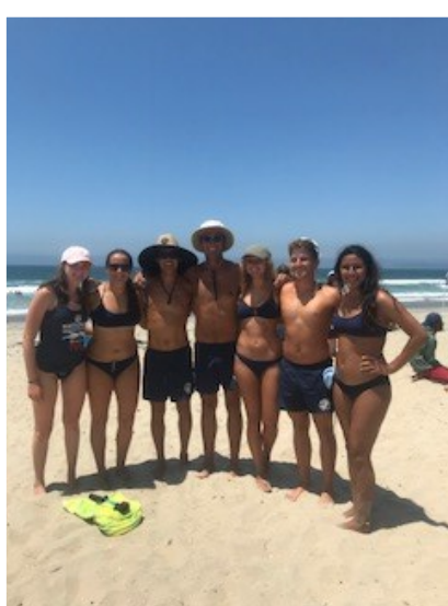
U 19 Competition Team