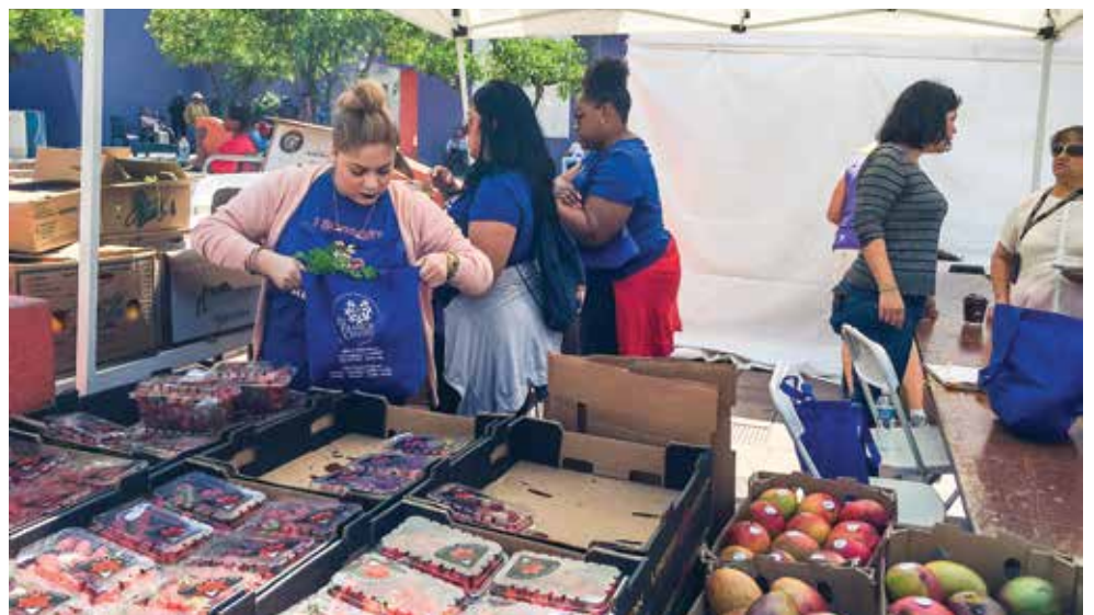
At Feeding the 5000, Republic Services volunteers created meal bags with surplus food from local food banks.

Wasting less food will help us achieve the Zero Waste LA goals. Thank you to Republic Services Los Angeles employees for being food waste warriors and working with community partners on feeding people before feeding landfills.