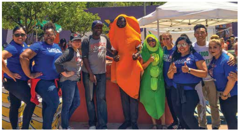
Republic Services Los Angeles employees took part in the Feeding the 5000 event in downtown Los Angeles.

Republic Services and Food Finders are partners in the Waste Not OC Coalition, whose mission is to feed the need in Orange County. The Coalition includes multiple agency partners and promotes food recovery and distribution, as well as training potential donors to handle food safely. To learn more or to get involved, visit WasteNotOC.org or call 855-700-WNOC (855-700-9662).